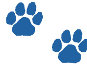
_____ Blue Mini Accents (for face and nails)