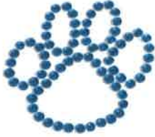
_____ Blue Crystal Bead Paw