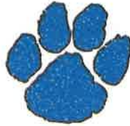
_____ Blue Glitter Paw Print