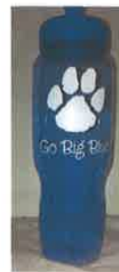
_____ Water Bottle

32 oz. BPA free blue clear bottle with white paw print imprint & "Go Big Blue"