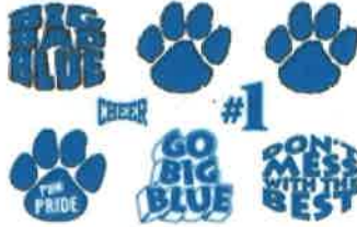
_____ Multi (Sheet Only)