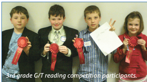
3rd grade G/T reading competition participants.

"From my point-of-view, I really like Read 180 because it helps your reading level and forces you to learn things. When I first started in this class I thought I wouldn't like it. That all changed after a few weeks. When I started my reading level was really low but after a few months, my reading level is at grade level. Having 20 minutes of silent reading does help, I thought I would never read, but I have already finished 5 books." 🐾