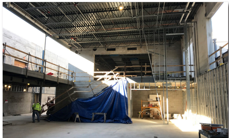
Library Looking Up