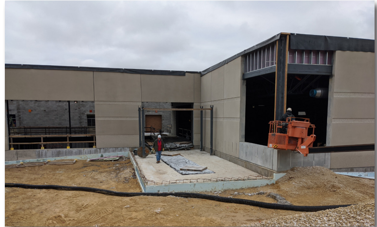
North Entry Exterior