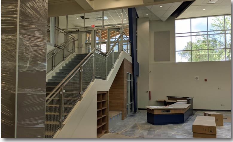
North Entry Stairs and Railings