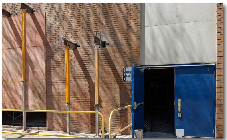
Cafeteria New Windows