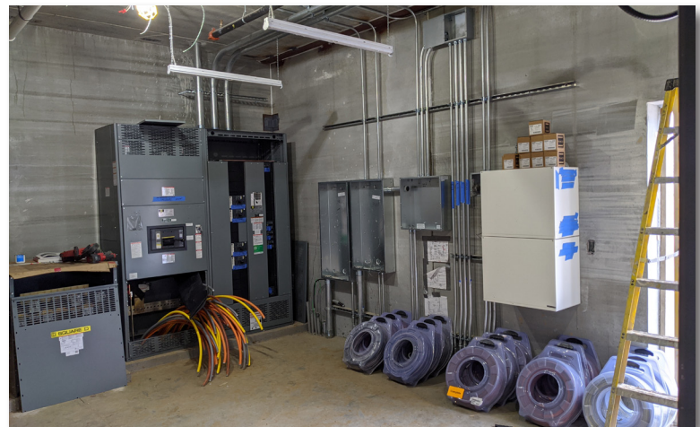
New Electrical Service