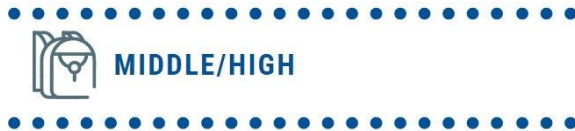
MS/HS Weekly Rotation