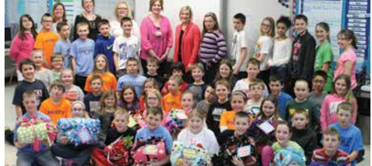
In December, as part of a service learning project, our 4th graders made 35 fleece blankets to give to kids in area hospitals. Approximately 25 of them were donated to the American Family Children's Hospital in Madison over the holidays. The remaining blankets were donated to Upland Hills Health recently. 4th grade families donated all of the fleece materials to make these blankets. Additionally, community volunteers helped the students with making the blankets.