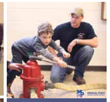
The Pre K classes visited the Mineral Point Fire Department to learn about fire safety and prevention procedures and were amazed with equipment presentations.