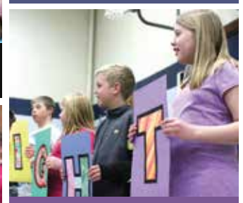
4th graders hosted Family Heritage Night in early April. The evening started with a potluck with ethnic dishes and included presentations and skits about the history of immigration, cultural songs, and the night was highlighted with a polka.